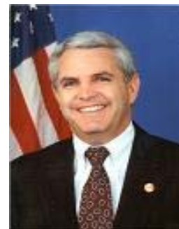
Representative John Shadegg