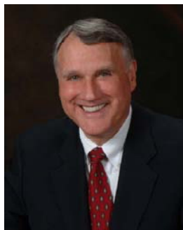
Senator Jon Kyl